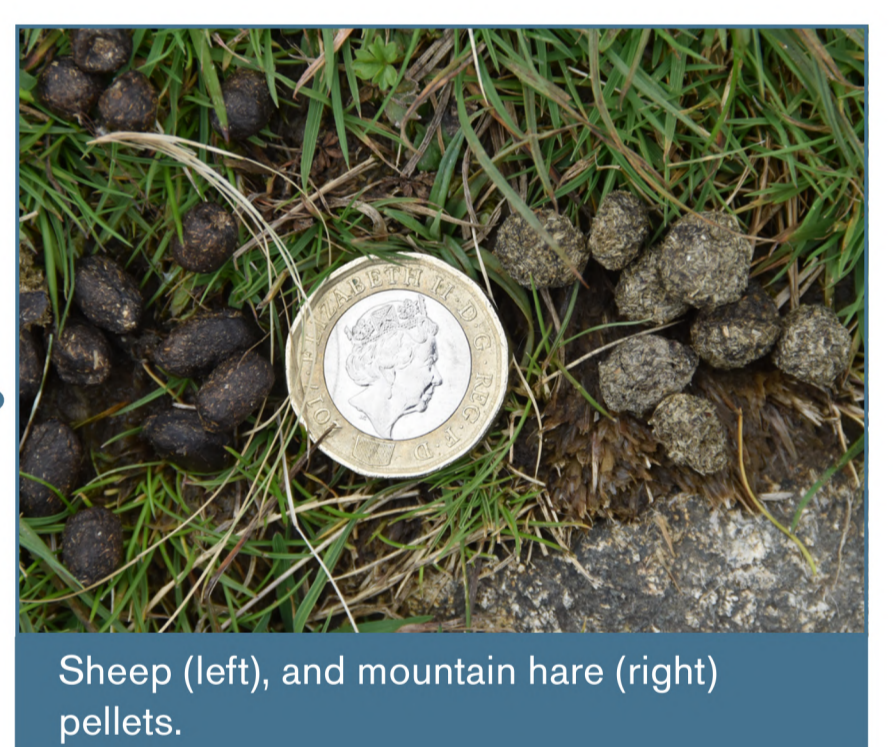
Sheep (left), and mountain hare (right) pellets.

Red deer pellets can be difficult to differentiate from mountain hare, especially as they become weathered, because they can be rounder and have vegetation fragments visible. Red deer pellets are usually larger than mountain hare pellets, typically 2-3 cm long by 1.5 cm diameter, but size is variable and can be similar to that of mountain hare. Usually dark-brown to black in colour, and often deposited in pellet groups.