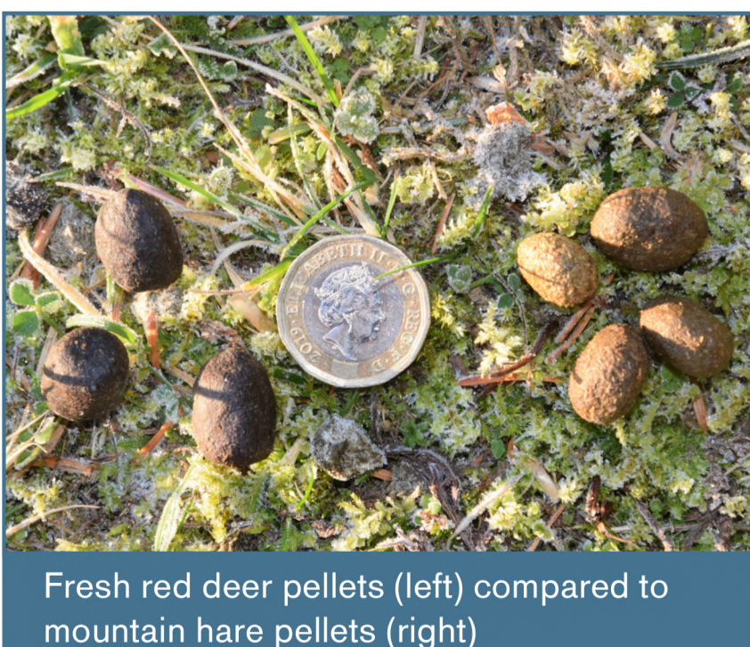
Fresh red deer pellets (left) compared to mountain hare pellets (right)