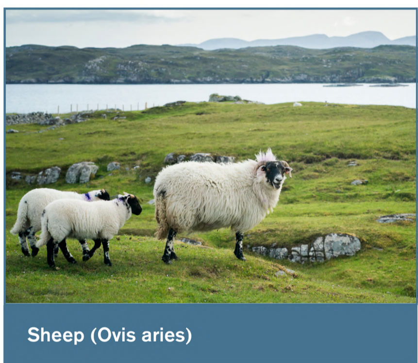
Sheep ( Ovis aries )

Deer and sheep dung can also be common in some upland areas, but can usually be distinguished from mountain hare pellets by their darker, usually black or brown, colour and the fact that their pellets are more cylindrical in shape and often have a distinctive point at one end and a dimple at the other. Sheep and deer pellets are often stuck together in clumps rather than single pellets.