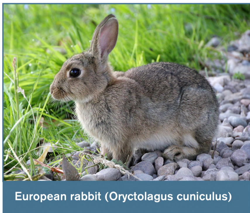
European rabbit ( Oryctolagus cuniculus )

Rabbits tend to be found at lower altitudes than mountain hares, but their distributions can overlap. Rabbit dung is similar to that of mountain hare, but smaller – usually 1 cm or less in diameter, darker in colour (usually black), usually harder than those of mountain hare, and can be very numerous near warrens, or around prominent features in their habitat.