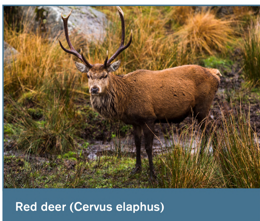
Red deer ( Cervus elaphus )

Red deer pellets can be difficult to differentiate from mountain hare, especially as they become weathered, because they can be rounder and have vegetation fragments visible. Red deer pellets are usually larger than mountain hare pellets, typically 2-3 cm long by 1.5 cm diameter, but size is variable and can be similar to that of mountain hare. Usually dark-brown to black in colour, and often deposited in pellet groups.