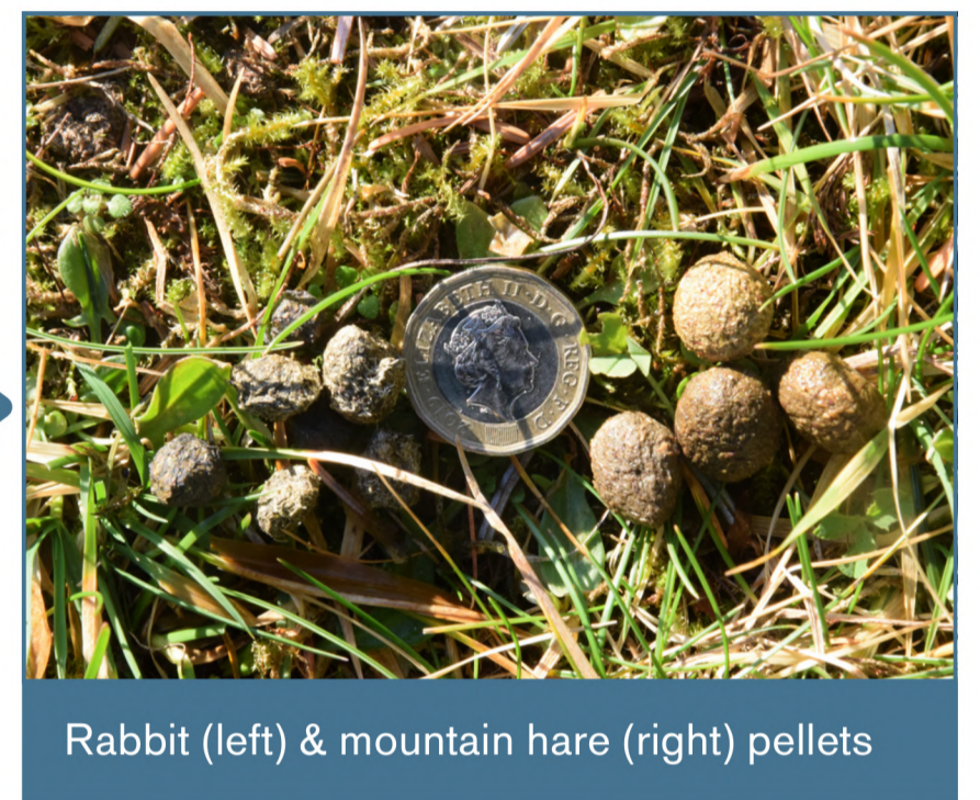
Rabbit (left) & mountain hare (right) pellets

Deer and sheep dung can also be common in some upland areas, but can usually be distinguished from mountain hare pellets by their darker, usually black or brown, colour and the fact that their pellets are more cylindrical in shape and often have a distinctive point at one end and a dimple at the other. Sheep and deer pellets are often stuck together in clumps rather than single pellets.