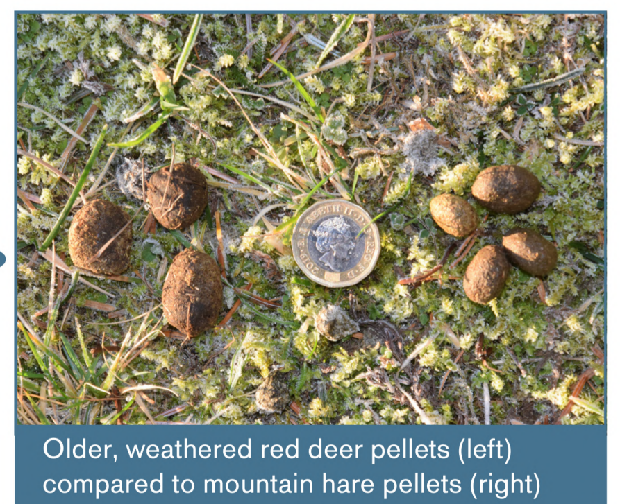
Older, weathered red deer pellets (left) compared to mountain hare pellets (right)